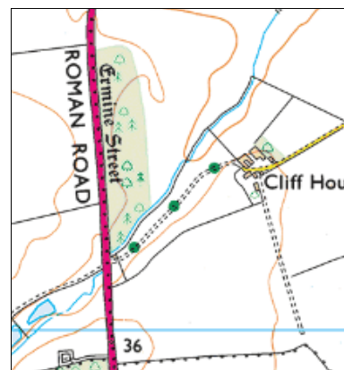
Explorer Series 1:25000