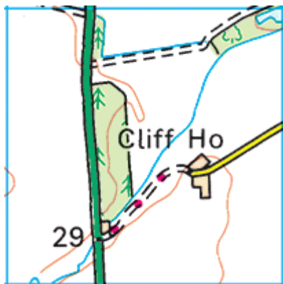
Landranger Series 1:50000

The notation does not tell you what rights of access may apply for these routes but there appears to be a general presumption that vehicle routes will apply.